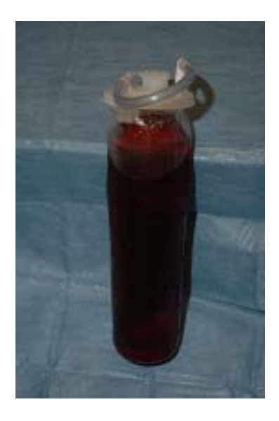
FIGURE 3 & 4